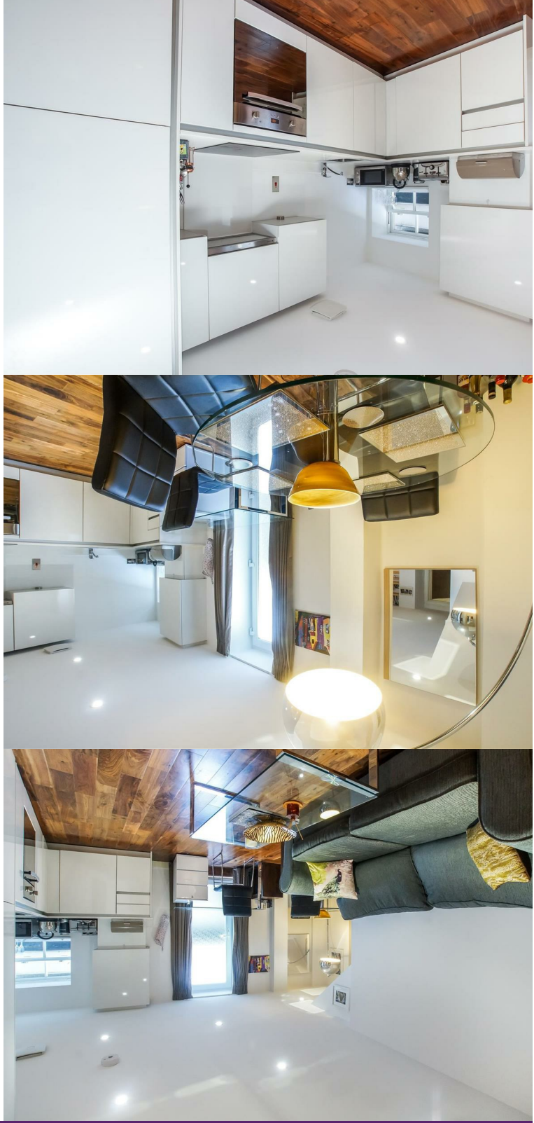
REGAL COURT, MALVERN ROAD, NW6 TOTAL APPROX. FLOOR AREA 448 SQ.FT. (42 SQ.M.) (EXCLUDING RESTRICTED HEAD HEIGHT) LOWER GROUND FLOOR

Architecturally designed & finished to a high specification... bright one double bedroom apartment with private secluded patio garden on the garden level of this modern style development. Entered via entry-phone intercom benefiting from high ceilings & low voltage lighting throughout, most conveniently located with all the amenities at your fingertips. The property offers over 448sqft of living/entertaining space comprising of bespoke fitted wardrobes in double bedroom, sizeable reception room, recess dining area, and contemporary white high gloss fitted kitchen with compound resin worktops and integrated appliances, marble effect tiling in a modern fitted bathroom. The property is offered unfurnished. Situated in the heart of the area, only a stone's throw of the bars/cafes, restaurants and shopping facilities of both Maida Vale & Queens Park. Available 2nd October